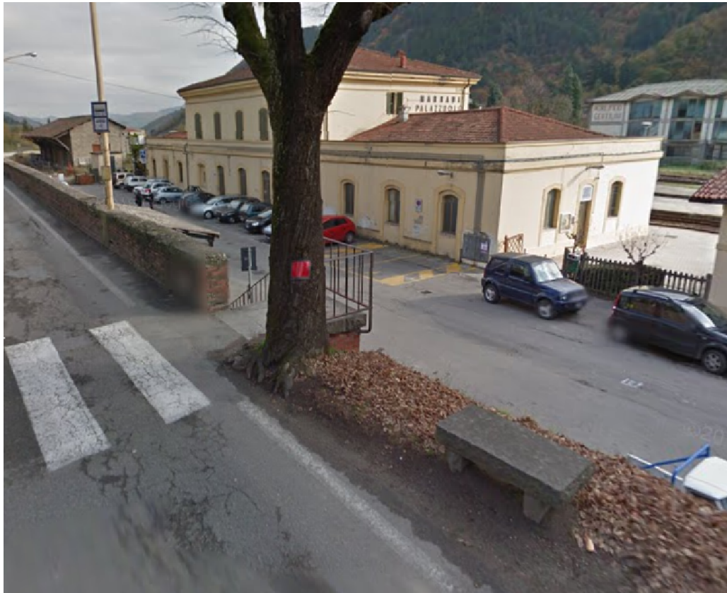
Bus Stop Marradi Lutirano